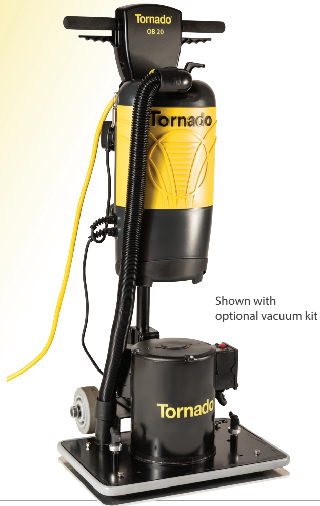
Shown with optional vacuum kit